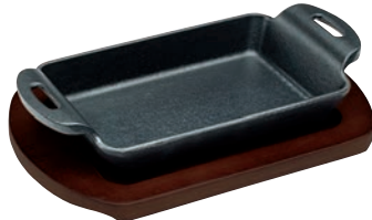
CASM-7TUL with CASM-7RT