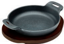
CASM-6RUL with CASM-6R