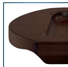
Handles to safely transport hot dishes