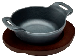
CAST-5UL with CASM-5R