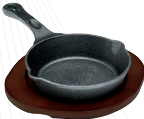
CAST-6UL with CAST-6