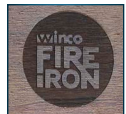
Engraved logo on bottom