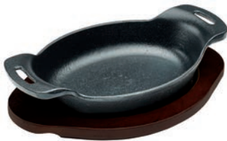
CASM-7OUL with CASM-7O