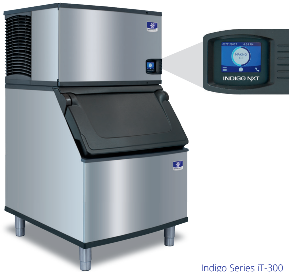
Indigo Series iT-300 Ice Machine on D-400 Bin *Ice Machine and Bin sold separately

Designed for operators who know that ice is critical to their business, the Indigo@w Series ice machine's preventative diagnostics continually monitor itself for reliable ice production. Improvements in cleanability and programmability make your ice machine easy to own and less expensive to operate.