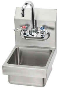
9"W MiniMax Hand Sink