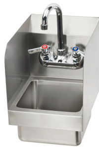
9"W MiniMax Hand Sink with Side Splashes