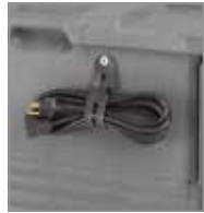
Removable cord stows securely for transport.

Tough, polyethylene exterior stays cool to the touch.