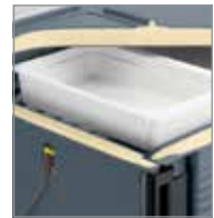
Thick foam insulation retains temperatures for hours, even when unplugged.

Both units are available in 110V and 220V models.