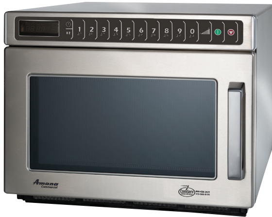
Model HDC212 shown